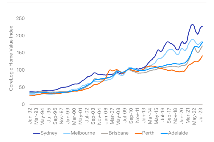
Figure 1 – Capital Cities – Growth in Dwellings<sup>1</sup> Index results as of November 30, 2023

During the most recent inflationary cycle and during the period since the RBA commenced the increasing of the RBA Cash rate, average dwelling values (all cities) have been volatile with sudden drops of c. 6.1% over a 8 month period, followed by c. 9.6% recovery in values (average across capital cities) such that values are relatively similar to what they were before the monetary policy tightening commencing in May 2022.1